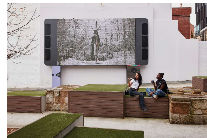
Public open space