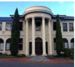
29. FRIENDS SCHOOL

Address: 23 William St, West Hobart Open: 10am-4pm, Saturday 5 November Highlights: Respectful arts and adds to brick interwar house. Check out the exterior tiles and fire place Building specs: Type: House Built: 2016 Architect: unknown, Core Collective