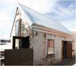
26. THE BARN

Address: Cnr Brisbane & Campbell Sts, Hobart Open: Pre-booked tours only, Saturday 5 November Highlights: underground tunnels, solitary confinement cells and gallows Tours: Pre-booked tours only at 11am & 1pm Building specs: Type: Church and gaol Built: 1834-59 Architect: John Lee Archer