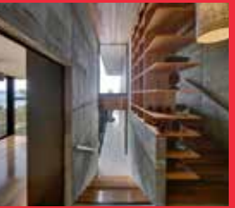
37. RIVER'S EDGE HOUSE

Address: 22 Gardena Gvy, Sandy Bay Open: 10am-4pm, Sunday 6 November Highlights: Fort, roof design and views Tours: Guided tours, bookings not required Building specs: Type: Fort & house Built: 1904, (Fort Nelson) 1949, 1966 and 1978 (Dorney House) Architect: Esmond Dorney