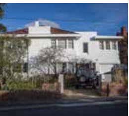
32. BOA VISTA ROAD

Address: 62 New Town Rd, New Town Open: 10am-2pm, Saturday 5 November Highlights: Craftsmanship, designed and built by architect owner Building specs: Type: House (Fish and chip shop conversion) Built: 2014 (renovation) Architect: Core Collective