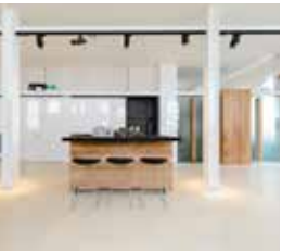
15. BRICKWORKS DESIGN STUDIO

Address: Franklin Wharf, Hobart Open: 10am-4pm, Saturday 5 November Highlights: Floating building, basement, innovative heating and cooling system Tours: Pre-booked tours only 1pm & 2pm (30 mins tours). Bookings essential Building specs: Type: Pier Built: 2014 Architect: Circa Morris-Nunn