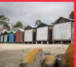
39. TAROONA BEACH BOATSHEDS

Address: 318 Channel Hwy, Taroona Open: 10am-1pm, Sunday 6 November Highlights: Oldest shot tower in Australia, original stairs, panoramic views Building specs: Type: Shot Tower Built: 1840 Architect: James Mair