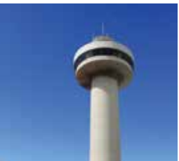
17. TASPORTS TOWER

Address: 25 Hunter St, Hobart Open: 10am-4pm, Saturday 5 November and Sunday 6 November (public spaces only) Highlights: 200 years of industrial heritage, art collection Tours: Pre-booked tours only at 10am & 2pm both days (45 mins tours). Bookings essential Building specs: Type: Converted warehouses, factory buildings and hotel Built: 1860, 2005 Architects: Unknown, Circa Morris-Nunn