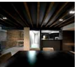
6. THE BASEMENT

Address: 23 Murray St, Hobart Open: 10am-2pm, Saturday 5 November Highlights: Bell ringers room, panoramic views of central Hobart, ornate ecclesiastical architecture Tours: Bell tower tours at 10am, 10.30am, 11am, 11.30am & 12pm (25 mins tours). Bookings essential Building specs: Type: Cathedral Built: 1868-1936 Architects: George F Bodley, Henry Hunter, Alan C Walker