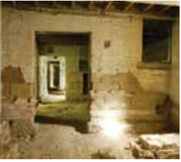
7. PARLIAMENT SQUARE HERITAGE BUILDINGS

Address: 105 Macquarie St, Hobart Open: 10am-1pm, Saturday 5 November Highlights: Simple design gestures Building specs: Type: Victorian Regency office Built: 1847, 2011 Architect: James Alexander Thompson, Preston Lane Architects