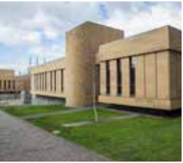
9. SUPREME COURT

Address: 4 Salamanca Pl, Hobart (enter via stairs near 10 Murray St) Open: Pre-booked tours only, Saturday 5 November Highlights: New premium office space Tours: Pre-booked tours only at 1pm & 2.30pm (40 mins tours). Closed-toe shoes required, solid rubber-soled shoes or boots only. Bookings essential Building specs: Type: Office Built: Under construction Architect: FJMT