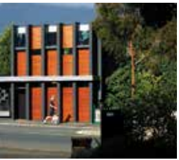
31. NEW TOWN ROAD HOUSE

Address: 1/14 Smith St, North Hobart Open: Pre-booked tours only, Saturday 5 November Highlights: Depth of space, industrial aesthetic Tours: 1pm, 12.0pm, 1.40pm, 2pm, 2.20pm, 2.40pm, 3pm, 3.20pm & 3.40pm (15 mins tours). Bookings essential Building specs: Type: Warehouse conversion Built: Unknown, 2007 Architect: Terrori