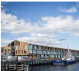
18. MAC 01-HOTEL UNDER CONSTRUCTION

Address: Hunter St, Hobart Open: Pre-booked tours only, Saturday 5 November Highlights: Unsurpassed views of Hobart's working waterfront Tours: 10am, 10.45am, 11.30am, 12.15pm, 1.30pm, 2.15pm & 3pm Building specs: Type: Observation tower Built: Unknown Architect: Unknown