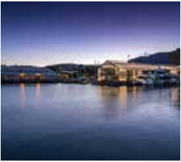
14. BROOKE STREET PIER

Address: Castray Esp, Battery Point Open: 10am-1pm, Saturday 5 November Highlights: Heritage listed, subterranean magazine Tours: 10am, 11am & 12pm. Bookings not required Building specs: Type: Magazine Built: Unknown Architect: Unknown