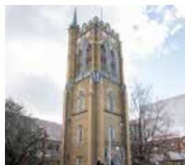
5. ST DAVID'S CATHEDRAL

Address: L1, 30 Argyle St, Hobart Open: 11am-4pm, Saturday 5 November Highlights: Contemporary art in an innovative warehouse conversion Building specs: Type: Showroom and offices Built: 1938, 2014 Architect: Philp & Wilson; Crawford, Cripps, Wegman, Core Collective