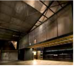
30. SMITH STREET WAREHOUSE

Address: 41 Sandy Bay Rd, Sandy Bay Open: 10am-4pm, Saturday 5 November & Sunday 6 November Highlights: Hobart's tallest building, art collection, kids' activities, site history and future on display Tours: Pre-booked tours at 10am, 11am & 1pm. Bookings essential Building specs: Type: Hotel Built: 1939, 1973 Architect: Keith Wildman, Roy Grounds