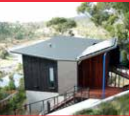
40. HILL HOUSE

Address: Taroona Beach, Taroona Open: 1pm-4pm, Sunday 6 November Highlights: vertical board vernacular, kids activities Building specs: Type: boat sheds Built: Unknown Architect: Unknown