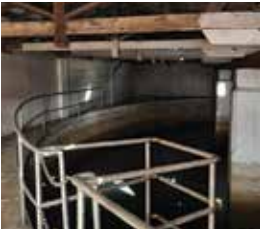
27. HILL STREET RESERVOIR + PUMP STATION

Address: 42C Goulburn St, Hobart Open: 1.30pm-4pm, Saturday 5 November Highlights: New meets old, award-winning architecture Building specs: Type: Barn conversion Built: 1820s, 2013 Architect: Alex Nielsen, Liz Walsh