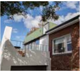
28. WILLIAM STREET HOUSE

Address: Cnr of Faraday and Hill Sts, West Hobart Open: Pre-booked tours only, Saturday 5 November Highlights: Go behind the scenes at one of the city's water treatment plants Tours: Pre-booked tours at 10am, 11am & 11.45am (30 min tours). Closed-toe shoes required. Bookings essential Building specs: Type: Reservoir and pump station Built: 1862, 1883, 1980 Architects: Unknown