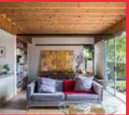
34. YORK STREET HOUSE