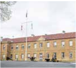
12. ANGELSEA BARRACKS

Address: 181 Macquarie St, Hobart Open: Pre-booked tour only, Saturday 5 November Highlights: Symmetrical illusion, gothic tower Tours: Pre-booked tour only at 10am (60 mins tour). Bookings essential Building specs: Type: School building, now offices Built: 1847, 2011 Architect: William Archer