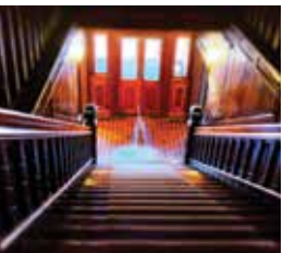
16. HENRY JONES ART HOTEL

Address: 9 Franklin Wharf, Hobart Open: 10am-4pm, Saturday 5 November Highlights: Old meets the future Building specs: Type: Office Built: 1886, 2015 Architect: Unknown, BYA Architects