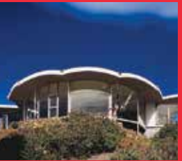
36. DORNEY HOUSE AT FORT NELSON

Address: Stanley Burbury Theatre, Administration Building, Churchill Ave, Sandy Bay Open: 1pm-3pm, Sunday 6 November Highlights: See into the past and the future of UTAS Tours: 2.30pm. Bookings not required Building specs: Type: University Built: 2015, under construction Architects: Preston Lane, Terrori