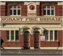
24. TASMANIA FIRE MUSEUM

Address: 91 Murray St, Hobart Open: 10am-2.30pm, Saturday 5 November Highlights: Glass curtain wall, textured concrete, historic archive, expansive city views Tours: Pre-booked tours at 10.30am & 11.30am. Building specs: Type: Library and archive Built: 1960, 1972 Architect: John FD Scarborough and Associates