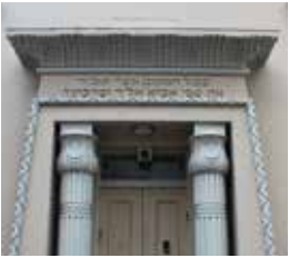
21. HOBART SYNAGOGUE

Address: 63 Liverpool St, Hobart Open: Pre-booked tours only, Saturday 5 November Highlights: Futuristic new office space featuring games area, meeting pods and inter-floor slide Tours: Pre-booked tours only at 2pm & 2.45pm (30 mins tours). Bookings essential Building specs: Type: Offices Built: 2015 Architect: JAWSARCHITECTS, BYA Architects