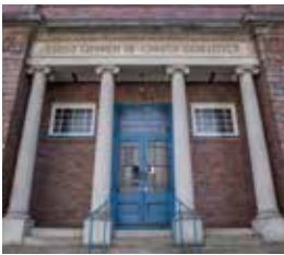
22. CHURCH OF CHRIST SCIENTIST

Address: 59 Argyle St, Hobart Open: 10pm-4pm, Saturday 5 November Highlights: One of the few remaining synagogues in the world built in the Egyptian Revival style, features hard benches used by Jewish convicts Building specs: Type: Synagogue Built: 1845 Architect: James Thomson