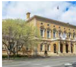
3. HOBART TOWN HALL

Address: 9 Elizabeth St, Hobart Open: Pre-booked tours only, Saturday 5 November Highlights: heritage restoration, see inside the clock Tours: 10am, 10.30am, 11am, 11.30am, 12pm, 1.30pm, 2pm, 2.30pm, 3pm & 3.30pm (20 mins tours). Bookings essential Building specs: Type: Post office Built: 1906 Architect: Alan C Walker