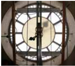
2. GENERAL POST OFFICE

Address: 18 Elizabeth St, Hobart Open: 10am-4pm, Saturday 5 November Highlights: Gargoyles, expansive rooftop views and multi-coloured hand painted terracotta tiles Building specs: Type: Office building Built: 1934-36 Architect: Hennessey & Hennessey