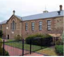
25. PENITENTIARY CHAPEL

Address: Argyle St, Hobart Open: Pre-booked tours only, Saturday 5 November Highlights: Fire-fighting vehicles and appliances Tours: Pre-booked tours only at 10am, 11am, 12pm, 2pm & 3pm (45 mins tours) Building specs: Type: Fire station Built: 1911 Architect: Department of Public Works