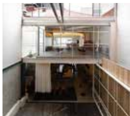
4. RAFT SOUTH

Address: 50 Macquarie St, Hobart Open: 10am-4pm, Saturday 5 November Highlights: Symmetry, chandeliers, organ and flower shows Tours: Pre-booked tours only at 11am, 12pm & 1pm (45 mins tours). Bookings essential Building specs: Type: Town Hall Built: 1866 Architect: Henry Hunter