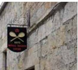
10. REAL TENNIS CLUB

Address: 1 Salamanca Pl, Hobart Open: Pre-booked tours only, Saturday 5 November and Sunday 6 November Highlights: Holding cells, court interiors Tours: Pre-booked tours only 10am Saturday 5 November & 10am Sunday 6 November. Bookings essential Building specs: Type: Court buildings Built: 1970s Architect: Peter Partridge