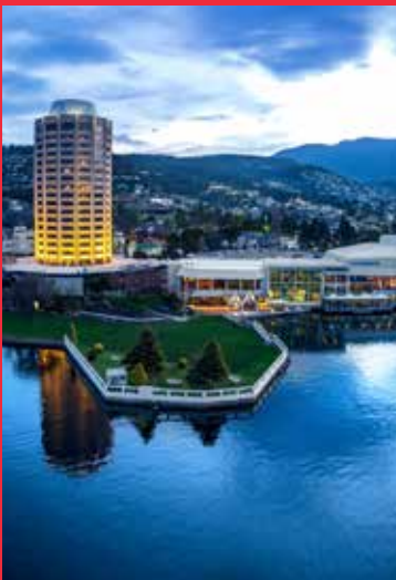
33. WREST POINT

For all tour bookings, visit openhousehobart.org