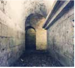
13. PRINCES PARK MAGAZINE

Address: 96-120 Davey St, Hobart Open: 10am-4pm, Saturday 5 November Highlights: Army Museum of Tasmania Tours: Pre-booked tours at 10am, 11am, 12pm & 1pm Building specs: Type: army barracks Built: 1814 Architect: John Lee Archer, David Lambe, JC Victor, Richard Turton, Roger Kelsall