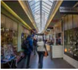
19. BANK ARCADE

Address: Hunter St, Hobart Open: Pre-booked tours only, Saturday 5 November Highlights: Waterfront building, construction site, 4.5 star hotel Tours: Pre-booked tours only at 10am, 11am, 12pm, 2pm & 3pm (45 mins tours) Building specs: Type: Hotel Built: Under construction Architect: Circa Morris-Nunn